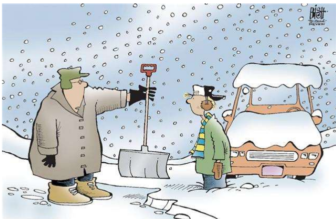
SORRY, SON...THERE'S NO APP FOR THAT